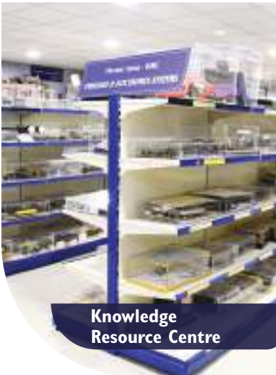
Knowledge Resource Centre