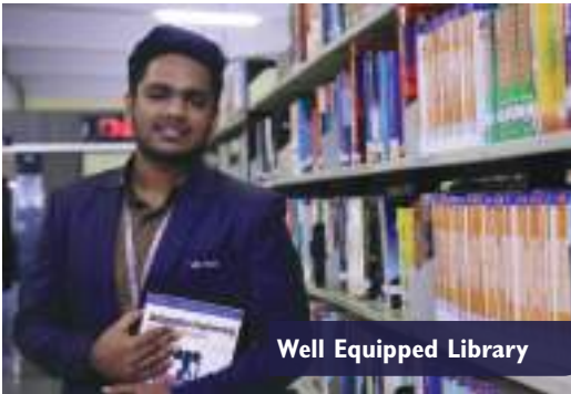
Well Equipped Library