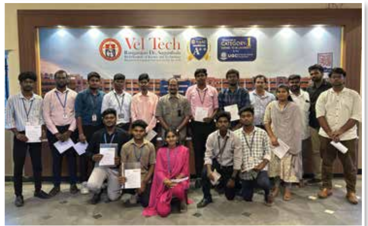
Shriram Chits Recruitment Drive for the Arts Students (3 rd April 2025)