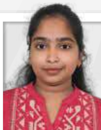
A Likhitha ECE with CS / VTU No: 20870