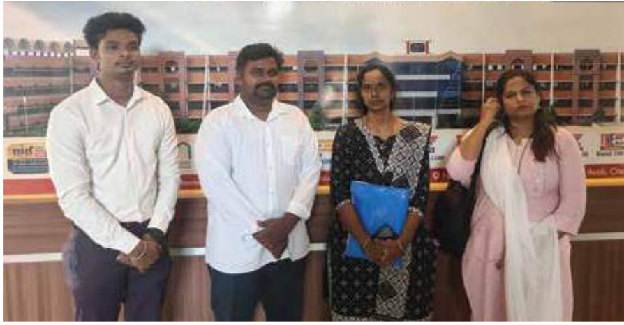
Meet the Apzem Recruitment Team (29 th April 2025 )