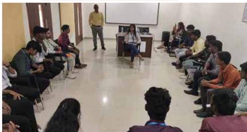
Prochant Placement Drive for the Arts Students (17 th April 2025)