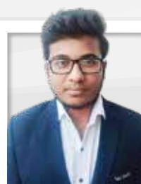
Chitte Yella Nagi Reddy CSE with AIML / VTU No: 20113