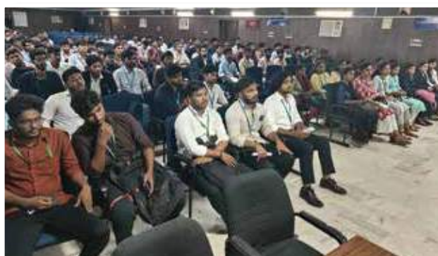
Qbotica Recruitment Drive (28 th April 2025)