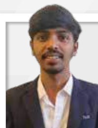
Sricharan CSE with AIML / VTU No: 20299