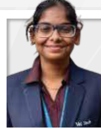
Bevara Manasa AI&ML / VTU No: 19867