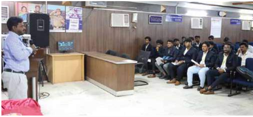
Belstar Microfinance Limited Recruitment Drive for the Arts and MBA Students (3 rd April 2025)