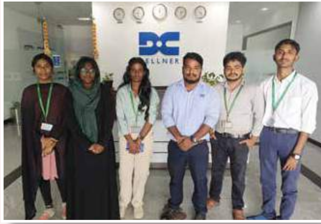
Dellner Recruitment Drive for the Arts Students (2 nd April 2025)