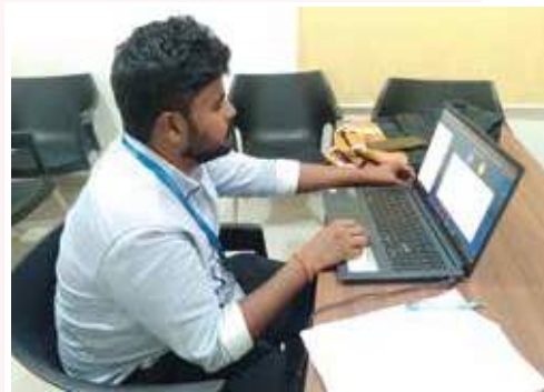
Inphase Recruitment Drive (16 th April 2025)