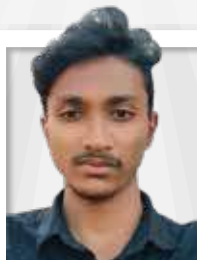
K Eswar ECE with AIML / VTU No: 19454