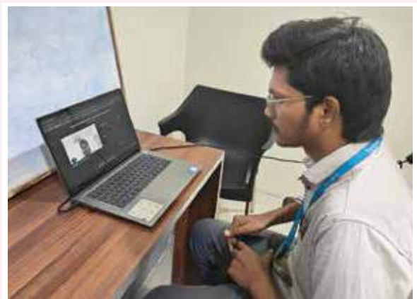
Stradegi Recruitment Drive (9 th April 2025)