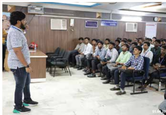
Merit Data & Technology Placement Drive for the Arts Students (1 st April 2025)