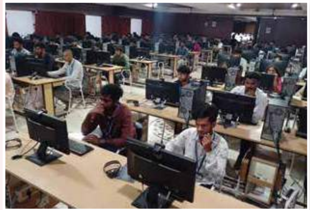
Knila Placement Assessment (29 th April 2025)