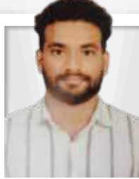
Sheik Sayyad ECE with AIML / VTU No: 20918