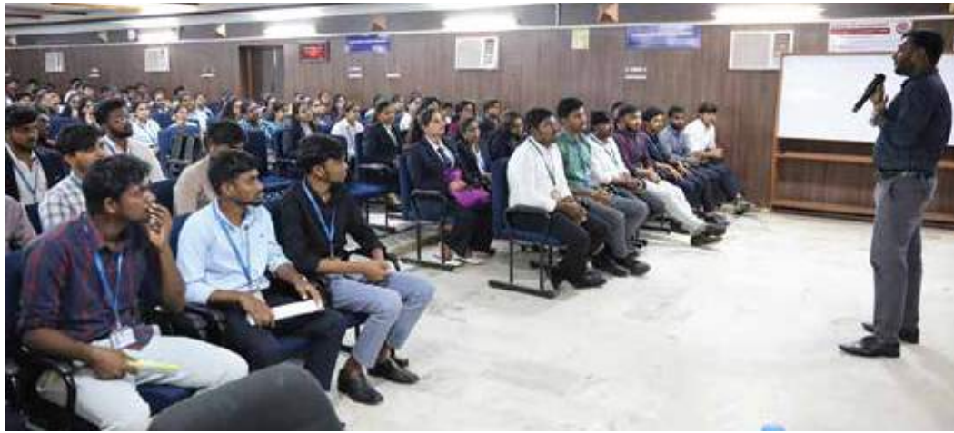
Movate Placement Drive (7 th April 2025)