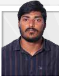
Kandara Mani Teja AI&ML / VTU No: 20692