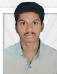
Adapa Bharat CSD with AIML / VTU No: 21313