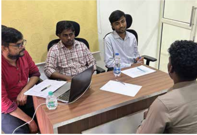
Energy Flow Placement Drive for the M.Sc Students (4 th April 2025)