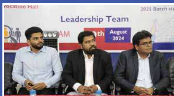
TCS Pre - Placement Talk