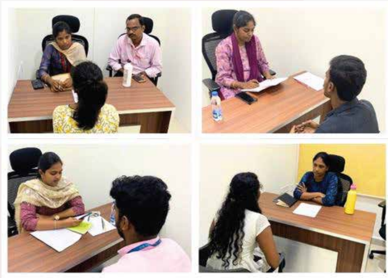
Mu sigma Pre-Screening Interview

Catch a sight of the pre-screening interview sessions conducted on 05-Aug-2024 and 07-Aug-2024 for the 144 assessment shortlists.