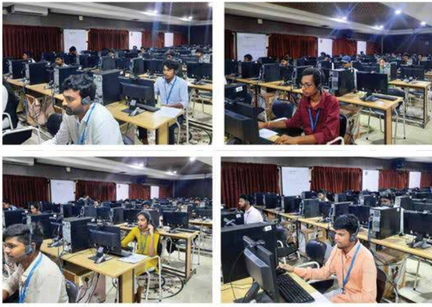
L&T Technology Services - Preparatory AI Interview