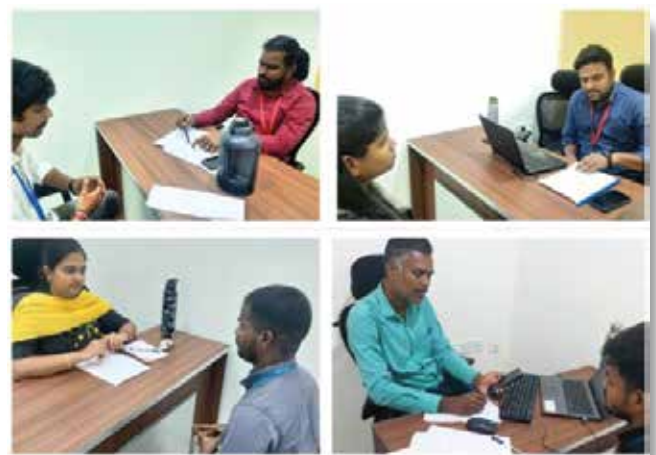
L&T Technology Services - Preparatory One-on-One Interview

Here is a glimpse of preparatory one-on-one interview and AI interview sessions conducted on 31-Aug-2024 for the 229 test shortlists.