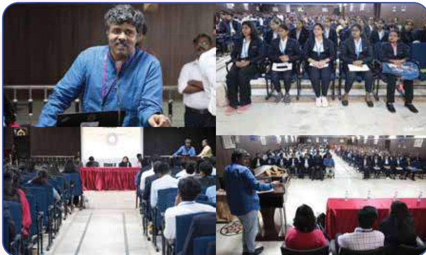
SASKEN - Placement Drive