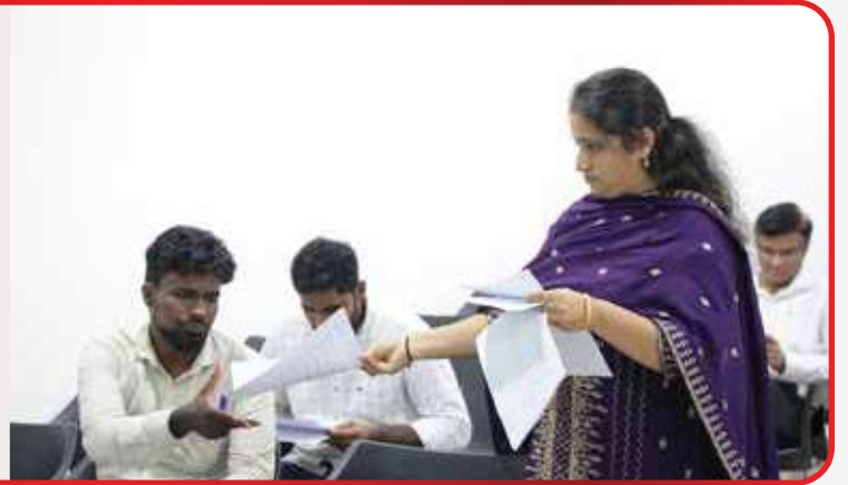
SCHWING Stetter - Placement Drive