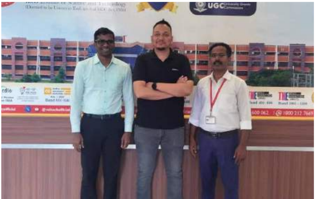
Engagement with Preludesys on Future Technologies