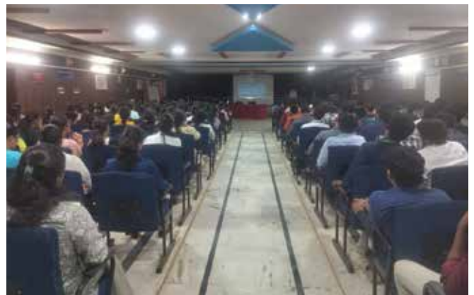
Mu Sigma Placement Drive on 7 th August 2025