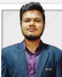
Marrivada Tarakeswar CSE with AIML / VTU No: 23999