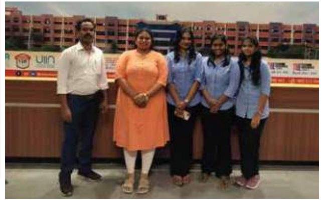
Tata Electronics Recruitment Drive on 9 th August 2025