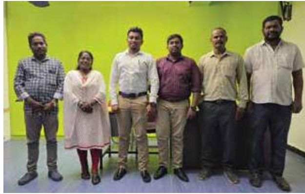
Noobiekid Recruitment Drive on 20 th August 2025