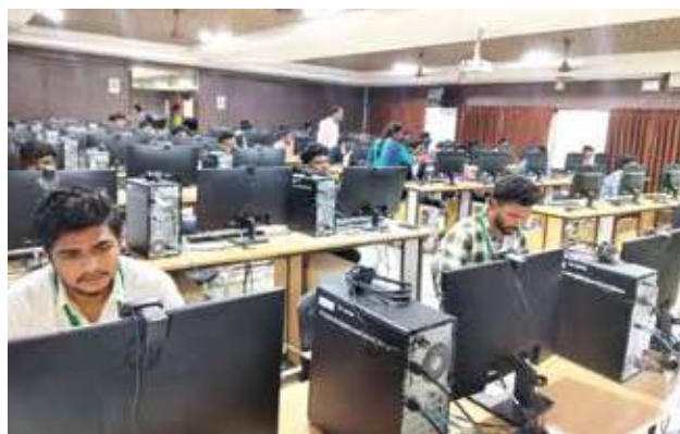
LTTs Recruitment Drive on 23 rd August 2025