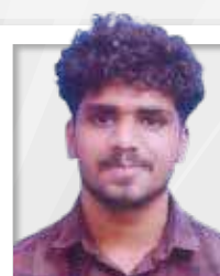
Berlin J H AIML / VTU No: 19820