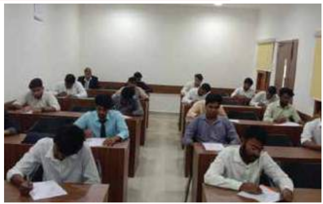
United Caravan Trading and Contracting - Campus Recruitment on 8 th August 2025