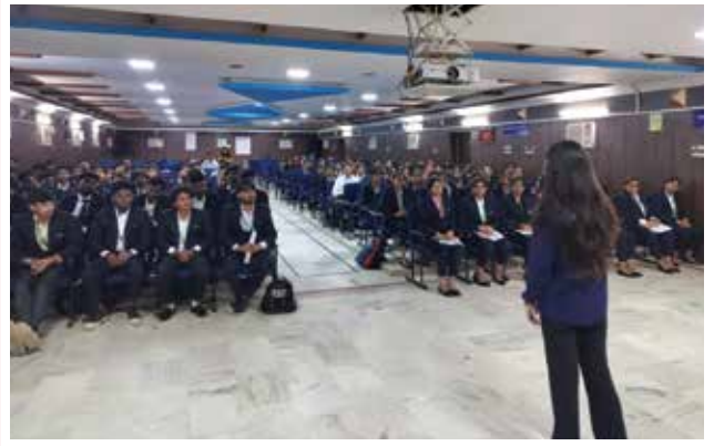
Amura Health Campus Recruitment on 18 th August 2025