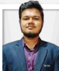
Tarakeswar CSE with AIML / VTU No: 23999