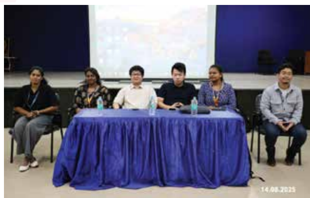
Yuzhan Technology Placement Drive on 14 th August 2025