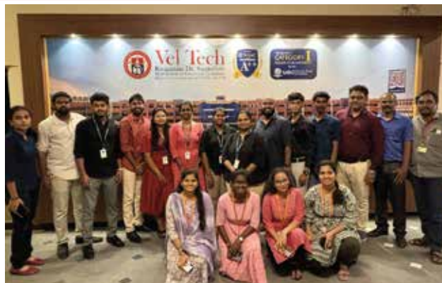
Innovalley Placement Drive on 22 nd August 2025