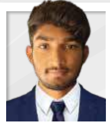
Yalla Raviteja ECE with AIML / VTU No: 20859