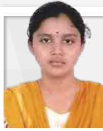
Arava Vandana ECE with AIML / VTU No: 21254