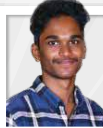
Chaithanya G CSE with ICSBCT / VTU No: 19493