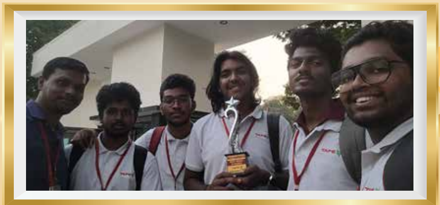
At Tafe Sembiyam factory