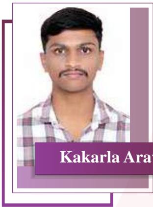
III Year - B.Tech - CSE (AIML)