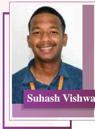
II Year - B.Tech - CSE