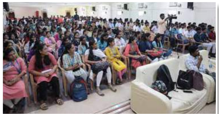
Open Text Campus Drive (13-Feb-2025)