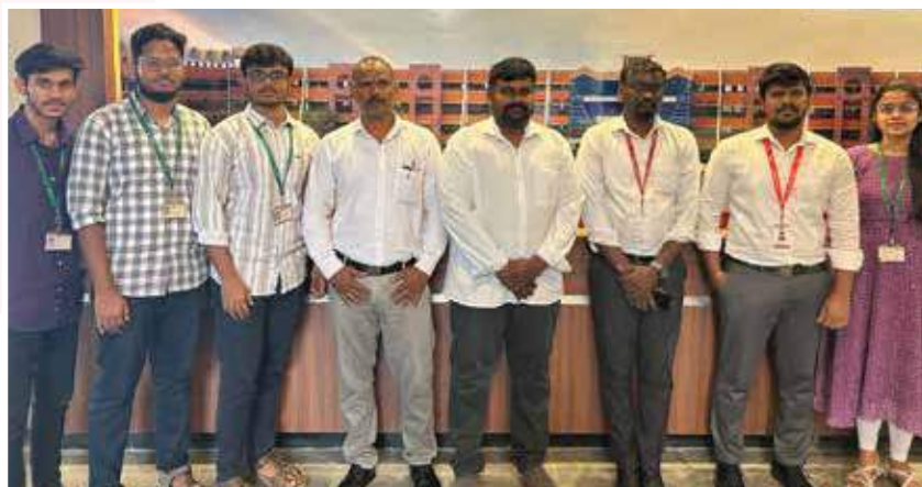
Muthoot Finance Placement Drive for the Arts Students (21-Feb-2025)