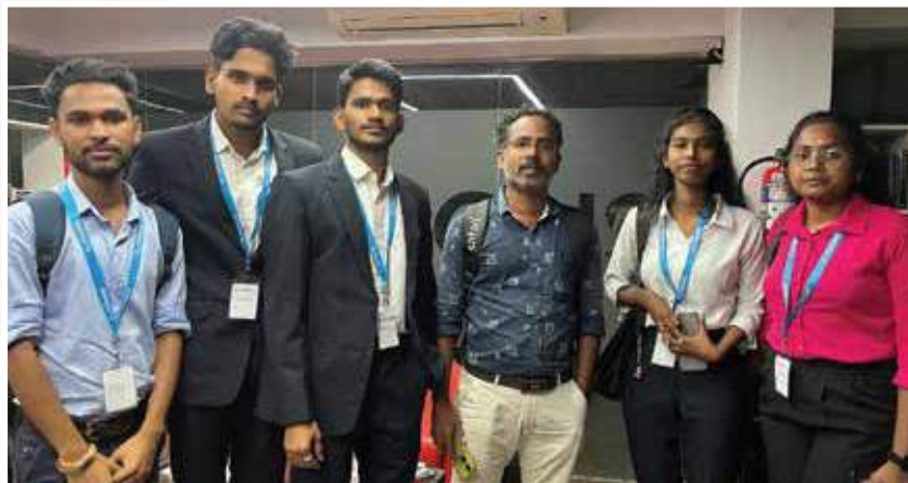
Flatrions Campus Drive conducted at their company premises (26-Feb-2025)