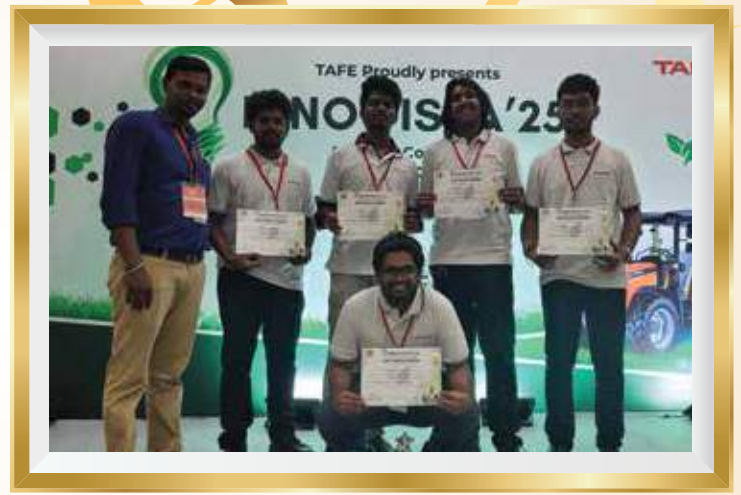
Secured Second Place in the "Mech Maverick Prototype" Innovation Challenge