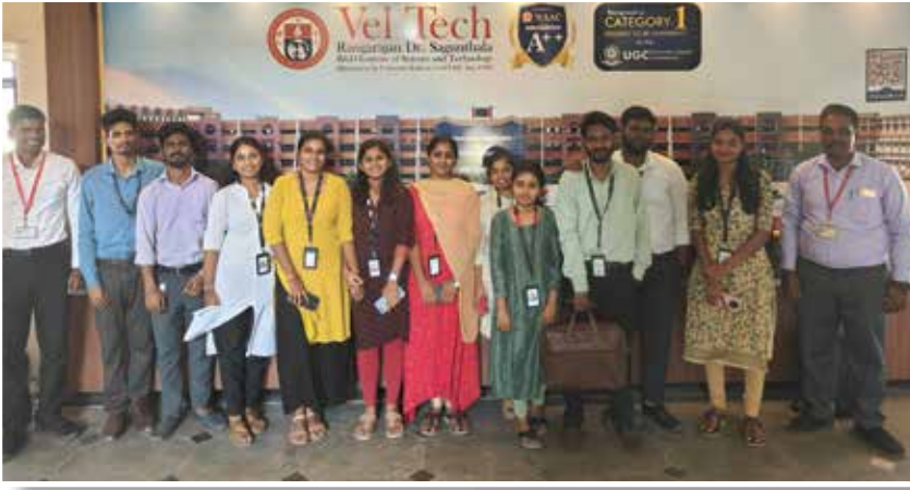
TCS - BPS Campus Drive for the Arts Students (22-Feb-2025)