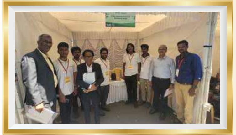
Our students with the jury members