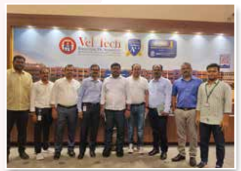
Megha Engineering Campus Drive (15-Feb-2025)