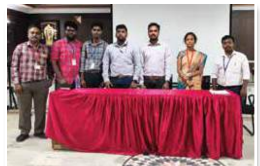
Fuso Glass Campus Drive for the Arts students (20-Feb-2025)