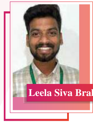
III Year - B.Tech - CSE (AIML)