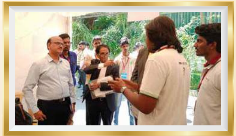
Explanation of the project model