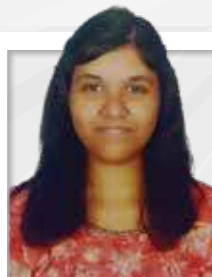
Sri Sakthi CSE with AIML / VTU No: 19792