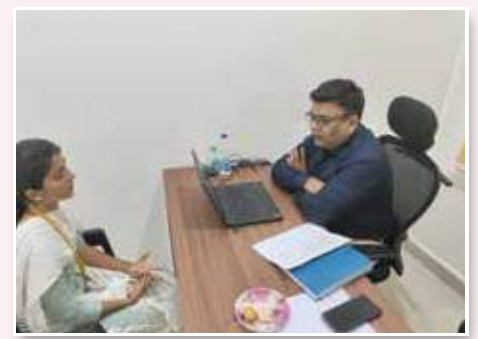
Ascendion Placement Drive (12-Feb-2025)