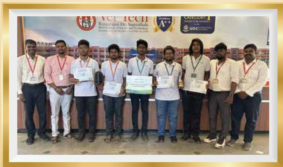
Meet our achievers with their Placement Coordinators