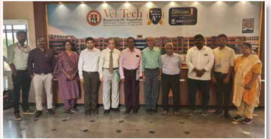
City Union Bank Drive for the MBA students (25-Feb-2025)