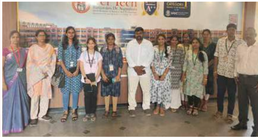
BankBazaar Campus drive for the Arts students (19-Feb-2025)