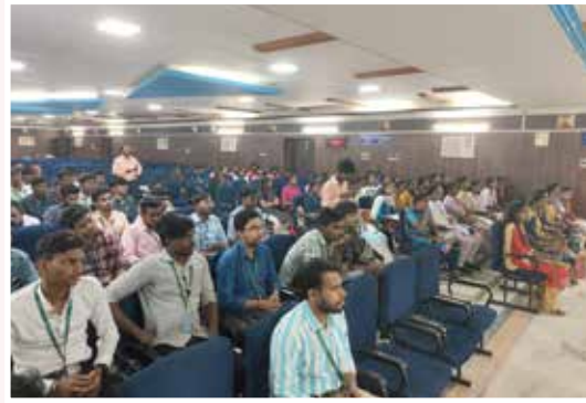
Niva Bupa Recruitment Drive for the Arts Students (07-Feb-2025)