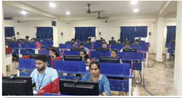
UST Global Online Assessment (12-Feb-2025)