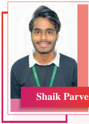
III Year - B.Tech - CSE (AIML)