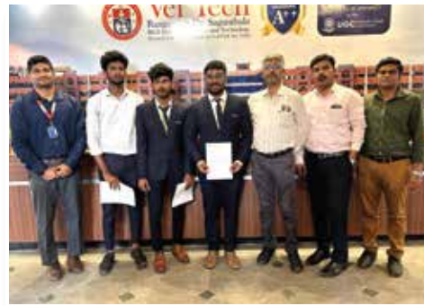
Kotak Life Recruitment Drive for the MBA students (04-Feb-2025)