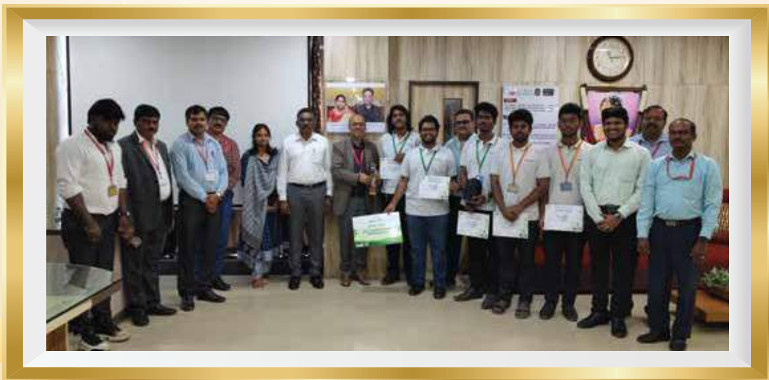
Felicitation of the achievers at our Vice Chancellor's Office