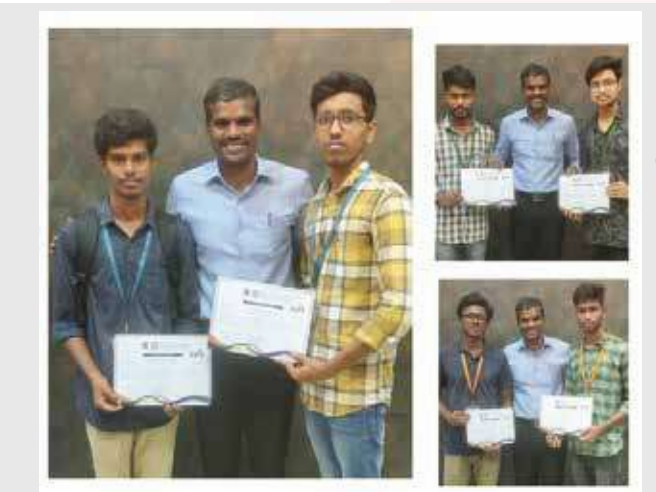
Winners honored with Certificates and Cash prizes