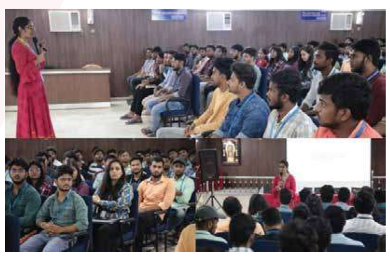
LTIMindtree - Campus Connect Session