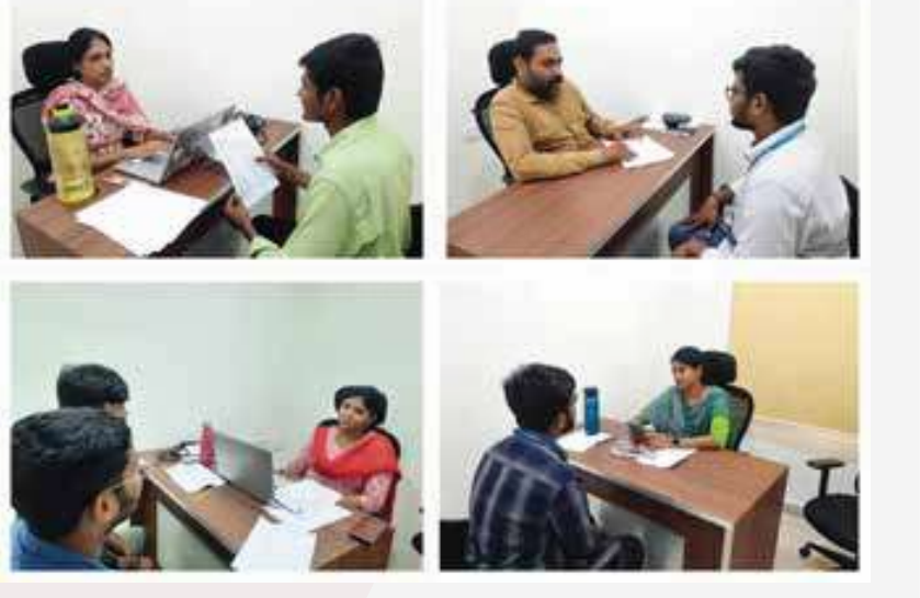
Genpact - Pre-Screening Interview

Here is a glimpse of the preparatory group discussion session organized on 16-Jul-2024 for the 52 test shortlists.