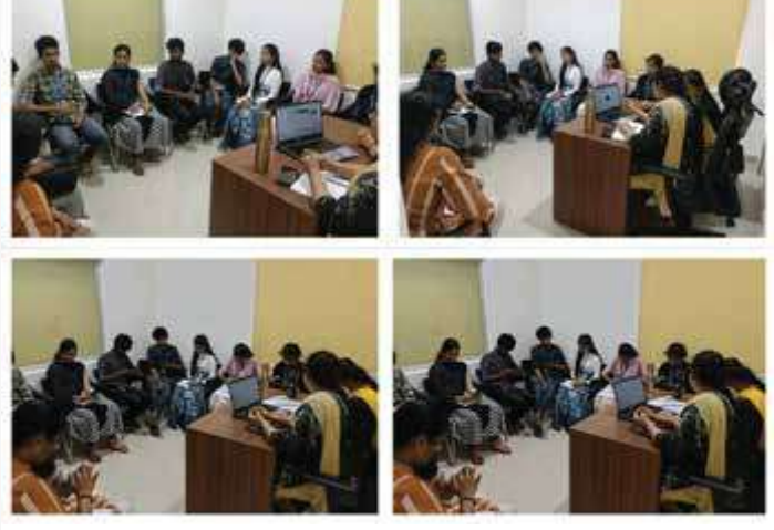
Kaar Technologies - Preparatory Group Discussion