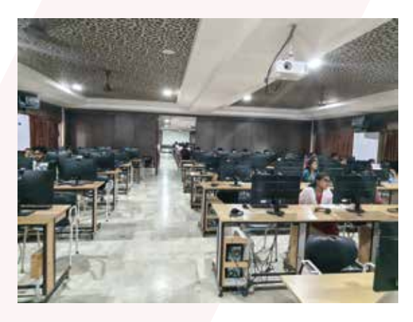
Multicoreware - Online Assessment