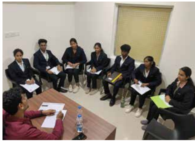
Kaar Technologies Placement Drive for 2026 YoP students (2 nd May 2025)