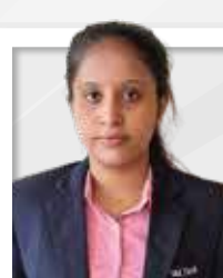
Bandi Sahithi Mechanical with AIR / VTU No: 24012