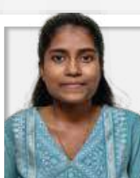
A Likhitha ECE / VTU No: 19382