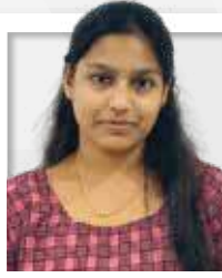
Gorentlapranaya ECE with AIML / VTU No: 20517