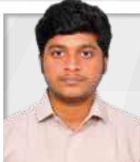
Eegai Valan CSE with AIML / VTU No: 19215