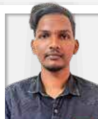
P Govardhan Mechanical with AIR / VTU No: 24086