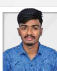
Vetti Revanth Mechanical with AIR / VTU No: 24061