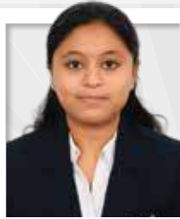
E Jananie Bio Tech / VTU No: 20255