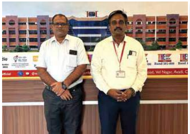
Sopra Steria Placement Drive for the MBA students of 2025 YOP (10 th May 2025)