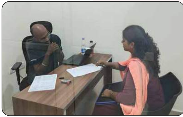
A glance at Ascendion Recruitment Drive