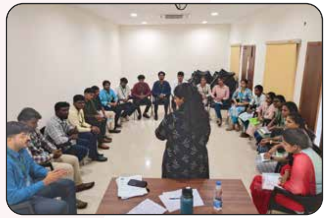
Catch a sight of Sutherland Recruitment Drive conducted for Arts Graduates