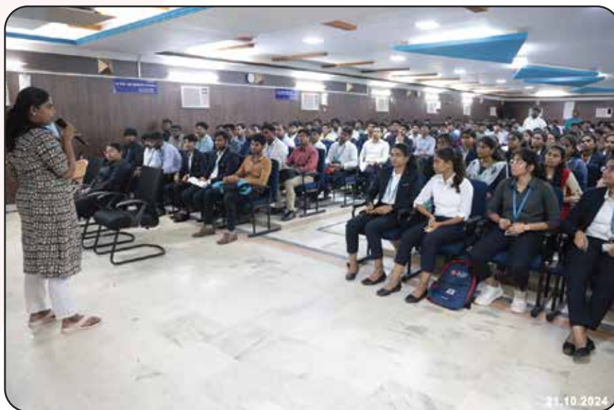
A snapshot of Mastech InfoTrellis Recruitment Drive