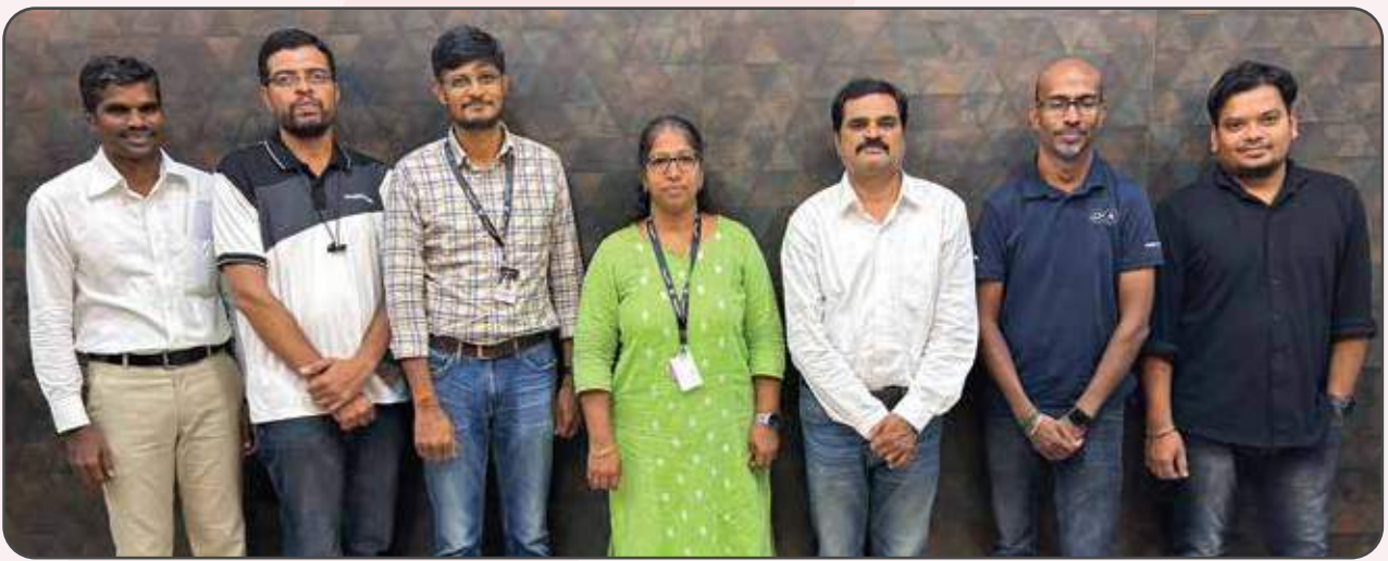
A special moment with the Ascendion Recruitment Team