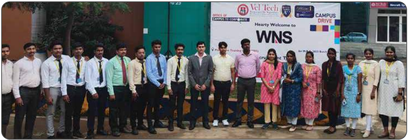
WNS Recruiters with the Placed Students