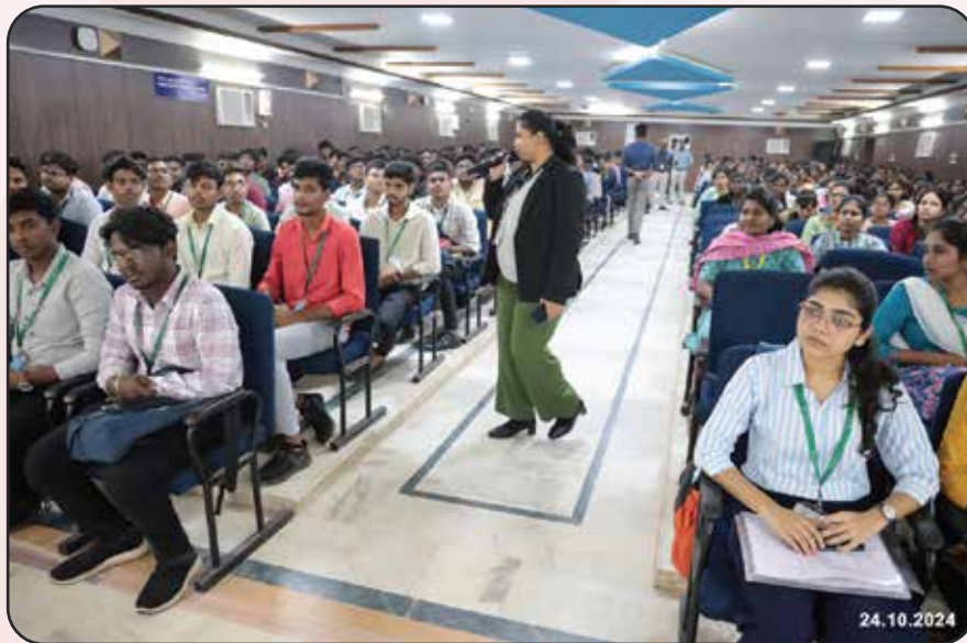
A view of QSpiders Recruitment Drive conducted for Arts Graduates