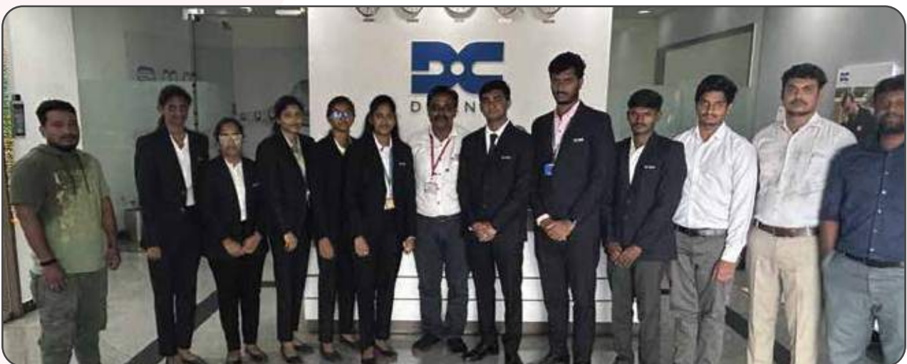
A momentary glance at Dellner Recruitment Drive