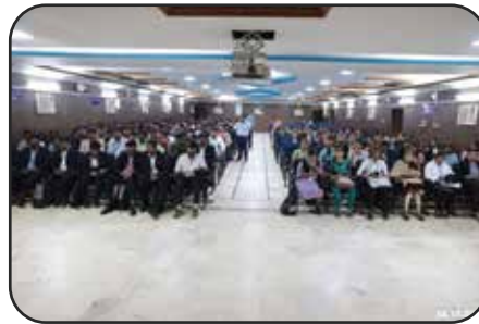
A glimpse of e-con Systems Recruitment Drive