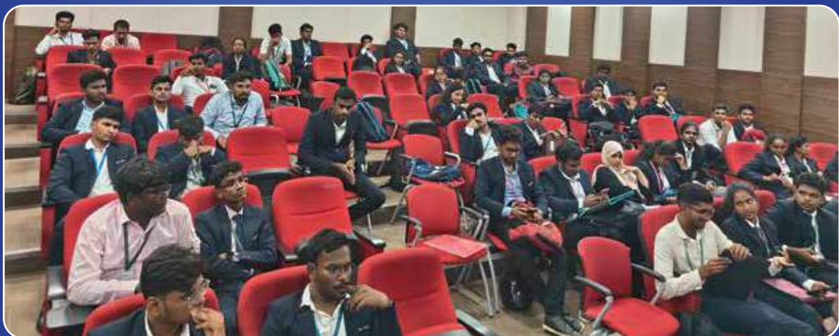
A passing view of Tech Mahindra Interview at Tech Mahindra office premises