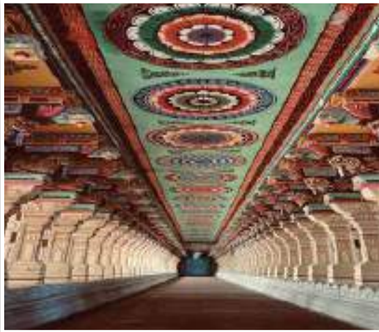
Ramanathaswamy Temple, TamilNadu