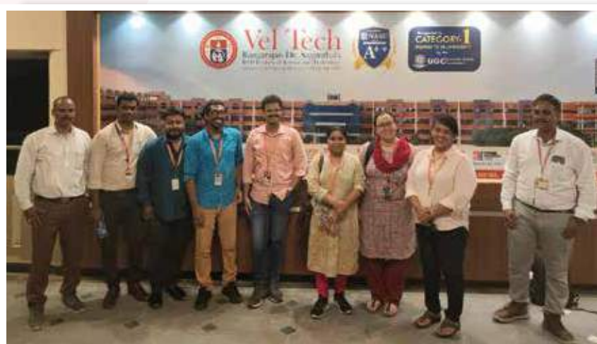
Movate Campus Drive – 13 th October 2025