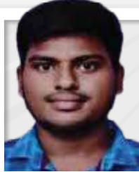
Umapathy B.Com / VTA No: 2120