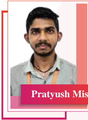
III Year - B.Tech - CSE