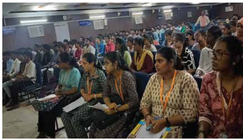
Saanvi Structural Soln Campus Drive – 17 th October 2025