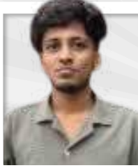
Pujazhenthii B.Com / VTA No: 2143