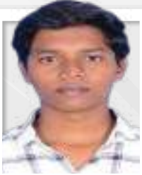
Royal. S B.Com / VTA No: 2092