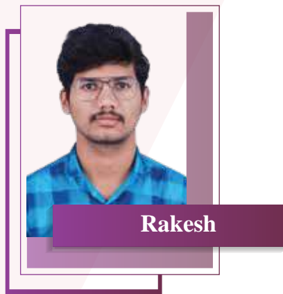
III Year - B.Tech - CSE