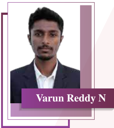
III Year - B.Tech - CSE