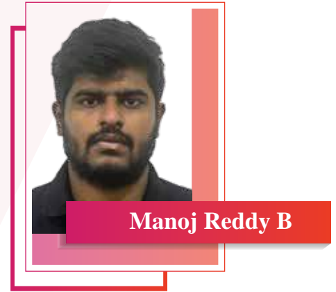
III Year - B.Tech - CSE