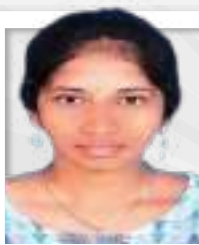
Swatika.S.S B.Com / VTA No: 2222