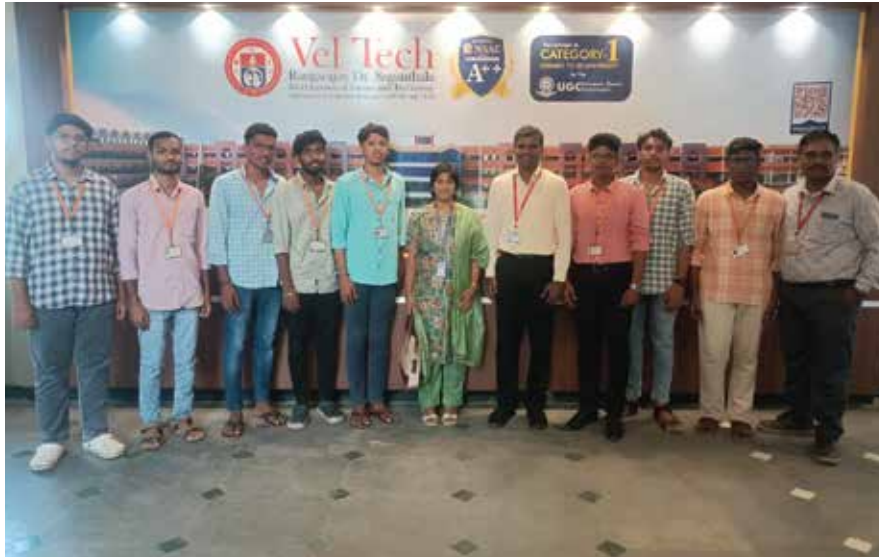
HCL Campus Drive – 7 th October 2026