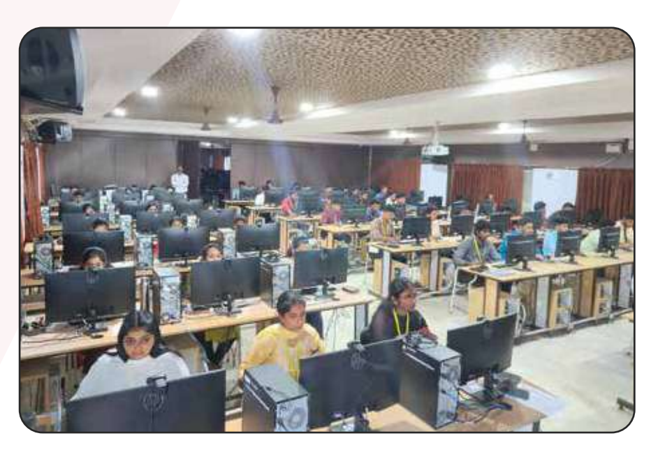
A Snapshot of WNS Recruitment Assessment