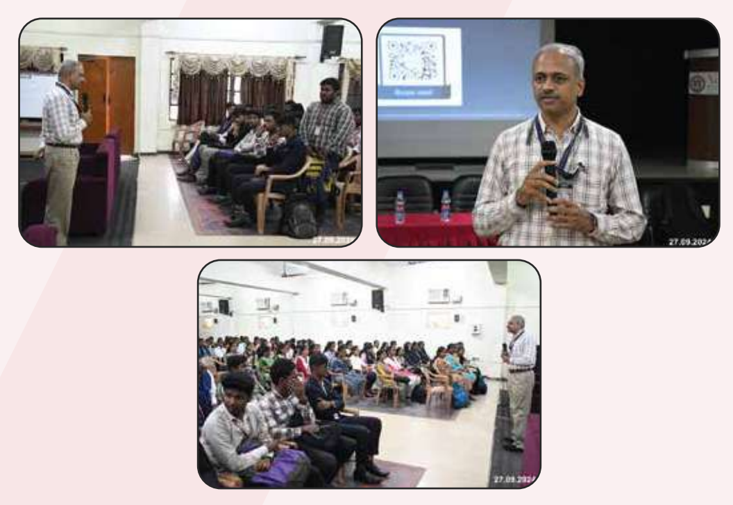
Visuals presenting Triyam Pre Placement Talk