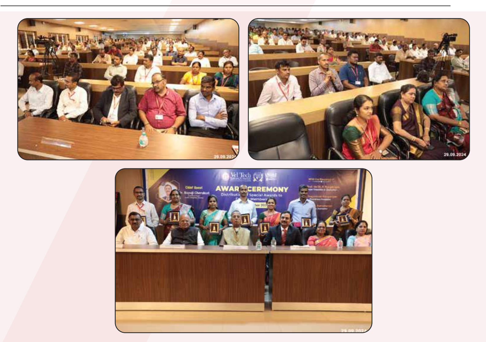
A Glimpse of Celebrating Excellence by Honoring Faculty Members for their Remarkable Contributions

And the state of the state of the second state of the state of the