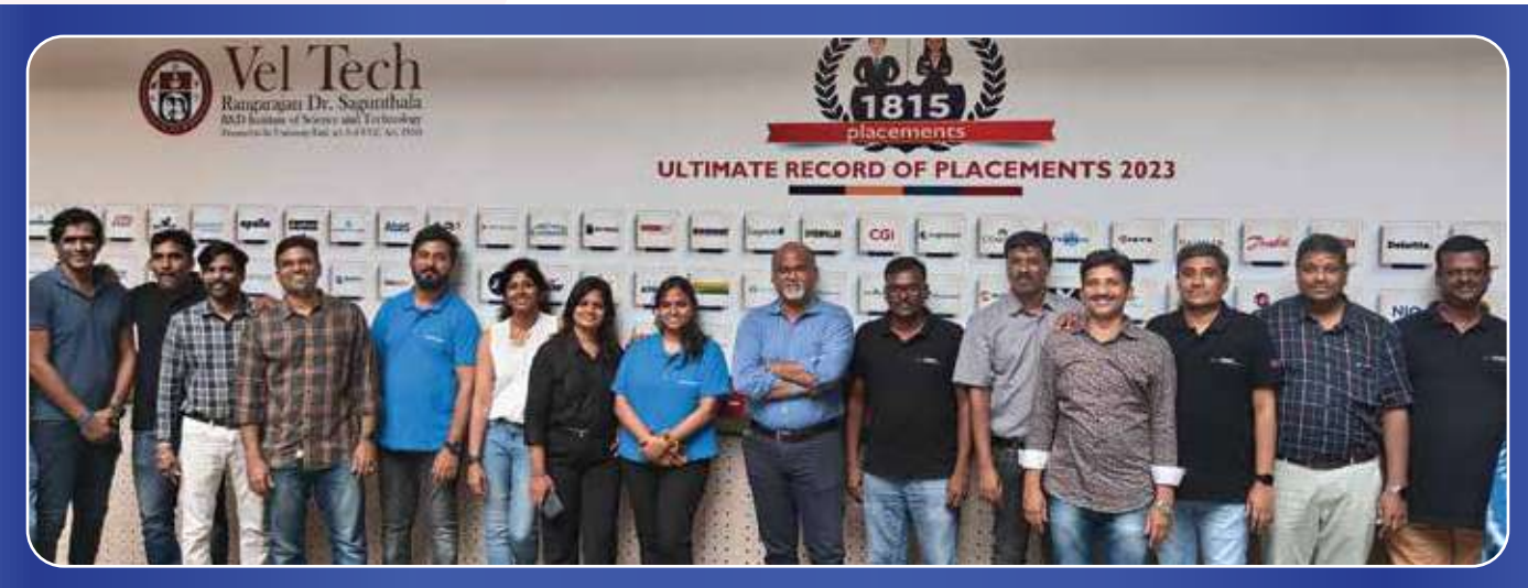
Meet the Recruitment Team of Renault Nissan Technology & Business Centre India