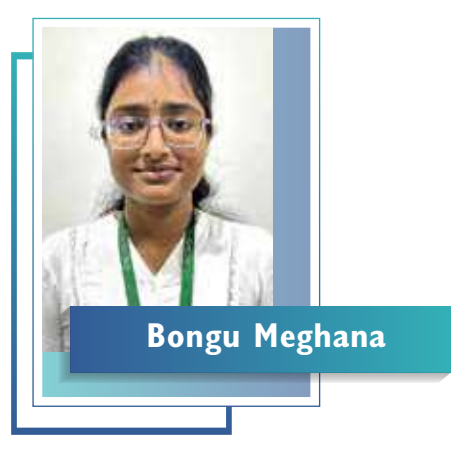
III Year - B.Tech. - CSE 3<sup>rd</sup> Prize Rs. 2000/-