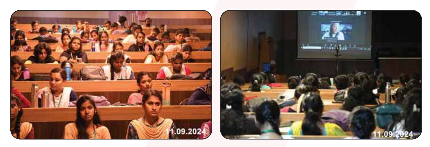
A View of Genpact Seminar on Empowering Women for Career Success