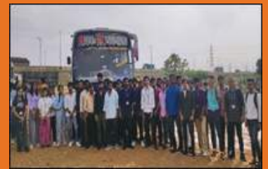
R. Stahl Private Limited, Maraimalai Nagar