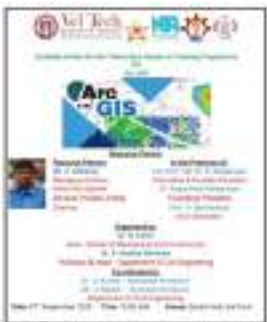
07.09.23 to 09.09.23: Three days Hands on Training on ArcGIS