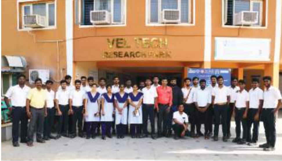
14.09.23: Executive Development Programmed for Employees of Delphi TVS on "Introduction to AI with No Code Environment.

We identify niche areas where training is required for employees by close interaction with industries. We set up Centre of Excellence facilities, enable our faculty to become trainers and conduct executive development Programmed in niche areas.