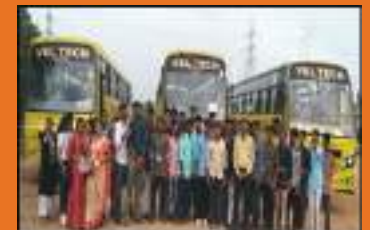
SSS Auto Suspension, Mathur