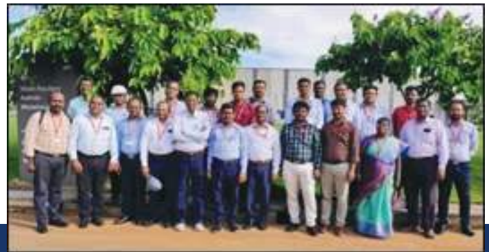
Visit to Wheels India Limited - CAW - ThervoyKandigai