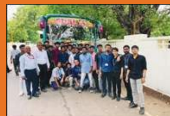
Hella Manado Automotive, Oragadam