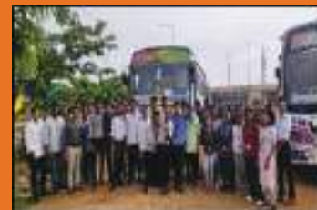
Delphi TVS, Mannur