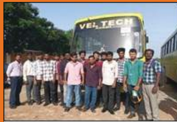
Tvs Brakes India, Padi

ICA Corporate visit on 18th & 19th of August 2023 to reputed companies right from the first day of student joining in our institution. this enables them to get acquainted with the best practices and trends.