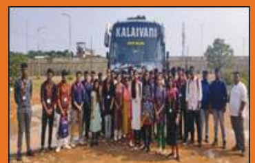
Roop Automotive, Chennai