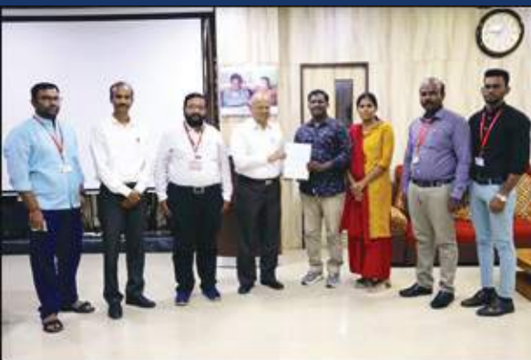
05.07.23 MoU with M/s.ImmuGenix Bioscience Pvt Ltd, Chennai for Department of Biotechnology Engineering to convert the classroom learning into solving the industrial demands in Strain Engineering and Product development aspects.