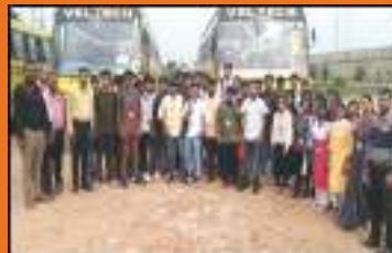
Ticel Bio Park Ltd, Taramani