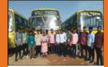
Tidel Park, Chennai