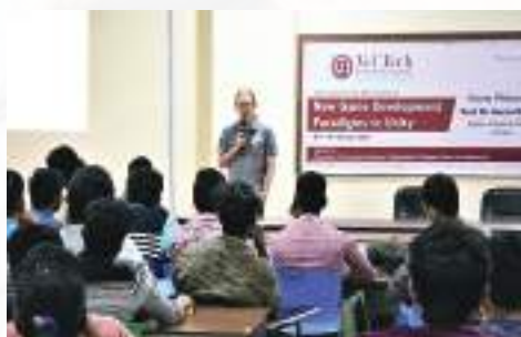
100+ International visiting faculties from 20 countries