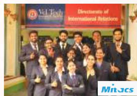
Students selected for Mitacs Globalink Research Internship, Canada with complete funding