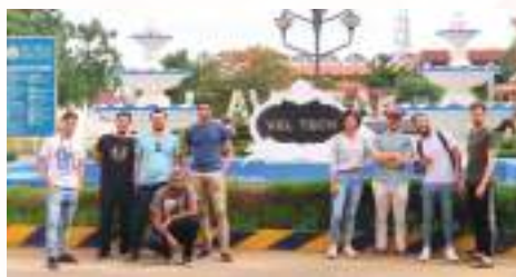
Students from Université de Tours, France for their Project Work at Vel Tech