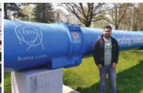
Research Internship at CERN (European Organization for Nuclear Research), Switzerland with 2.6 Lakh/month