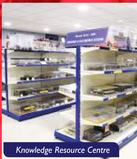
Knowledge Resource Centre