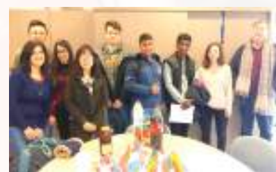
Final Year Project Work at Polytech Orleans, France under Semester Abroad Programme