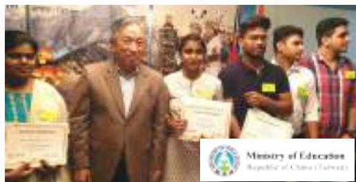
26 Students of Vel Tech were awarded Ministry of Education, Taiwan Scholarship for Higher Studies in last 5 years Tuition fee & Stipend of 48,000/month