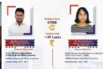
ERASMUS MUNDUS SCHOLARSHIP by EUROPEAN UNION