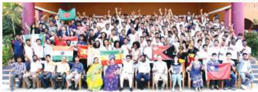
International Students of Vel Tech during the Annual International Students Meet